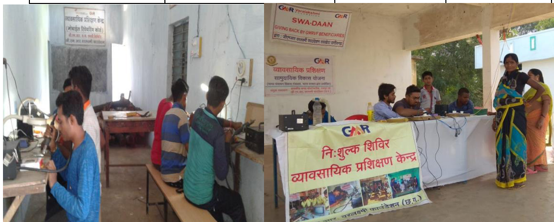
Skill Trainings in the Villages